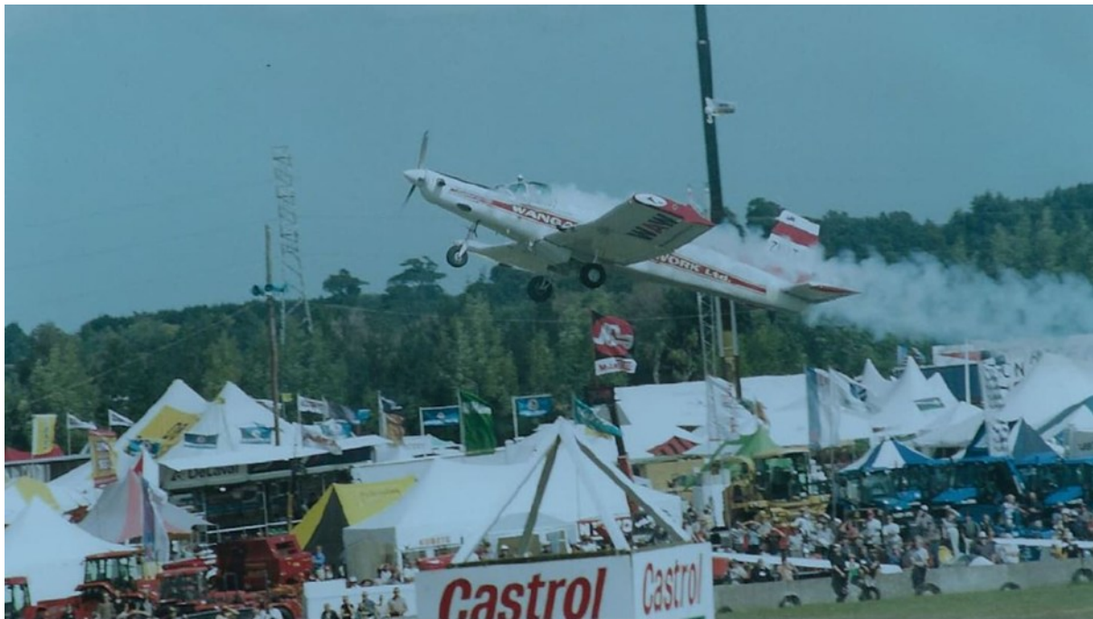
Photo taken at the Central Districts Field Days poss. 2017

FIELD DAYS Origins As A&P shows became primarily entertainment, another type of event emerged. This was the Field Day—a display of new machinery and technology for the modern farmer, often demonstrated under working conditions. The idea developed in Australia after the Second World War and began in New Zealand in 1953 with the South Island Agricultural Field Day. South Island Field Days The first South Island Agricultural Field Days were organised by the Christchurch District Young Farmer's Clubs, but since 2003 have been run by a society. They are held in conjunction with Lincoln University and the permanent site is on the university's research farm. The biennial event alternates with the Southern Field Days, organised since 1982 by the Eastern Southland Young Farmers Club and held at Waimumu, near Gore.