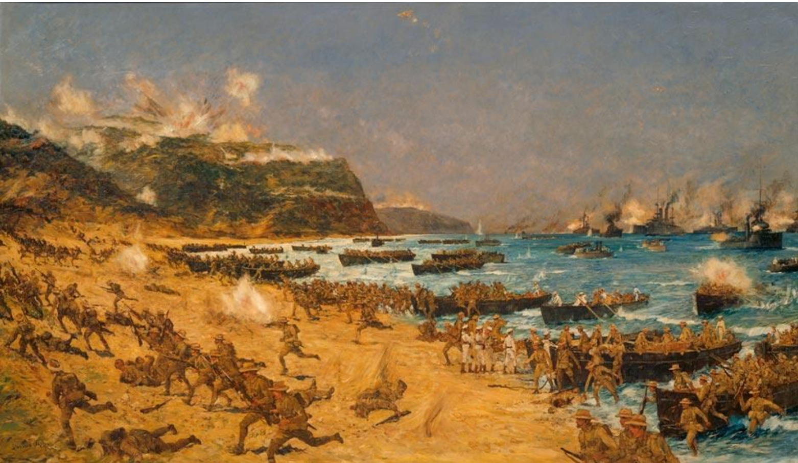
The landing at Anzac, April 25, 1915, by Charles Dixon

We will be hosting an ANZAC service at the Coach House Museum again this year. It starts at 9.30am followed by a 'pot luck' morning tea.