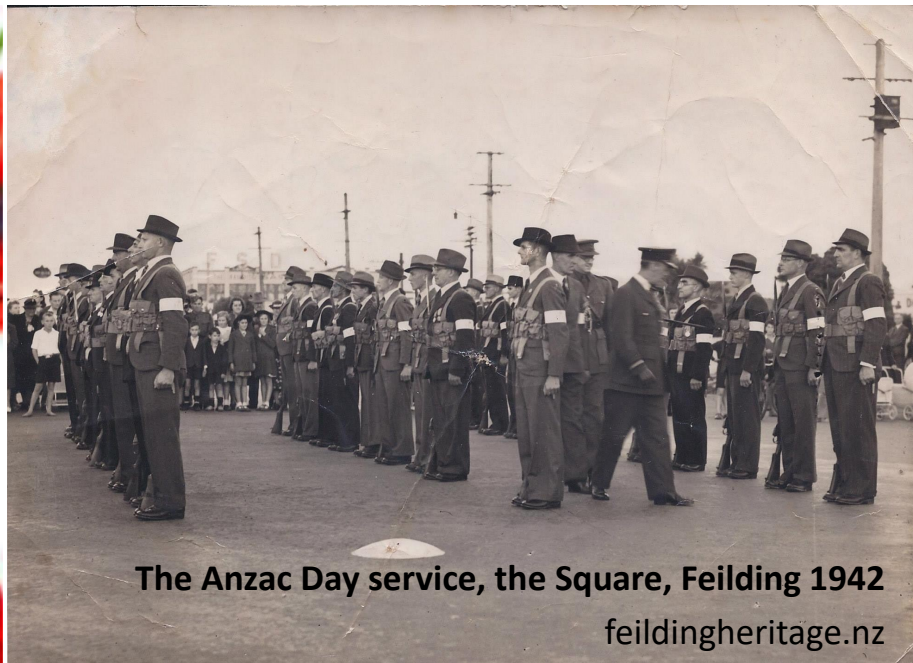
The Anzac Day service, the Square, Feilding 1942